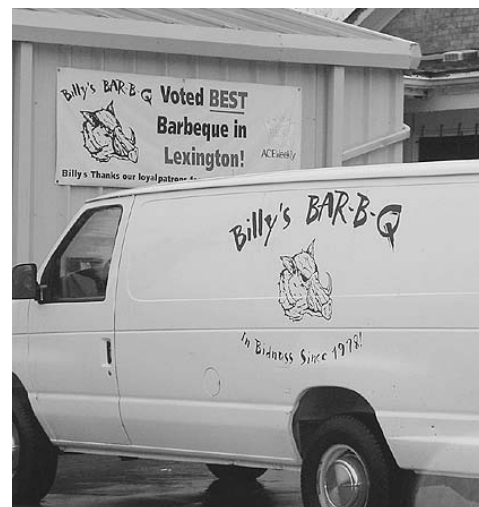
Billy's BBQ retired the BBQ category a few years ago

people screaming; or, how Billy's BBQ makes the entire Chevy Chase area smell delicious; or, story hour at Joseph-Beth; or, stumbling the block from Two Keys Tavern to Tolly-Ho for cheddar tots at 2:30 in the morning.