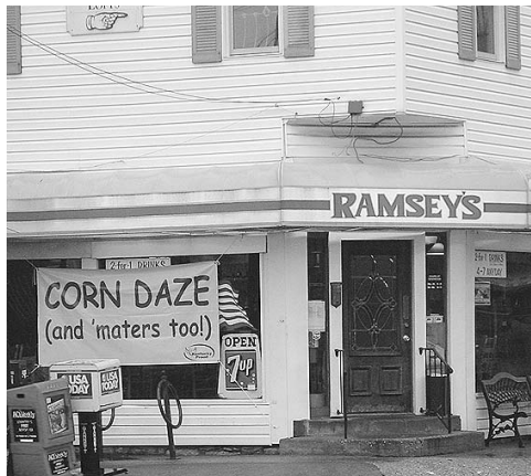
Who wouldn't be homesick for Ramsey's fried green tomatoes?

Or, tailgating at Commonwealth Stadium with ice-cold beer & spicy wings from Indi's