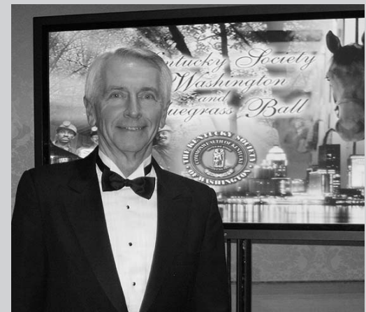
Governor Steve Beshear